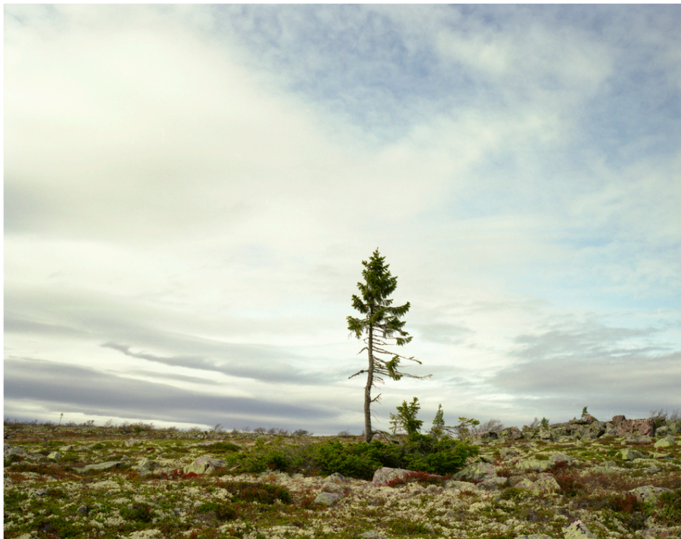
Spruce Gran picea #0909-11A07 (9,550 years old ; Sweden)