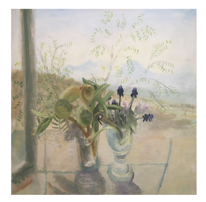
1st (or 3rd) June Inside/outside: Plants by the window

Zoom session will consist of: Looking at students work from the previous week and presenting this weeks project (as above). Students can also show other work and continuing personal projects.